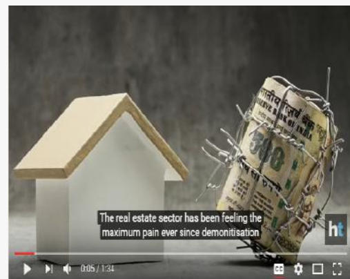
What real estate needs from budget 2017