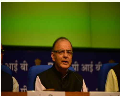
Finance Minister Arun Jaitley during Post-Budget Press Conference