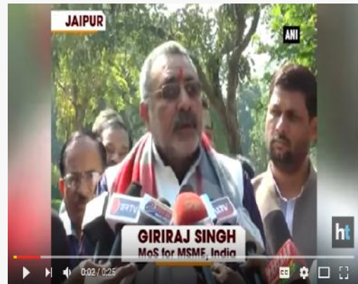
Giriraj Singh on 'Padmavati': Fabrication of history can't be tolerated