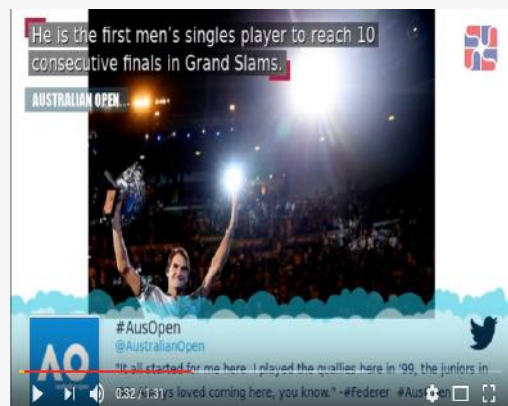
Roger Federer wins 18th Grand Slam after defeating Rafael Nadal