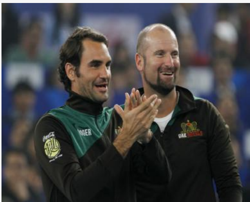
Roger Federer (Obi UAE Royals) during the International premier Tennis League