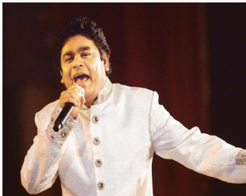
AR Rahman concert organized by fever 104.