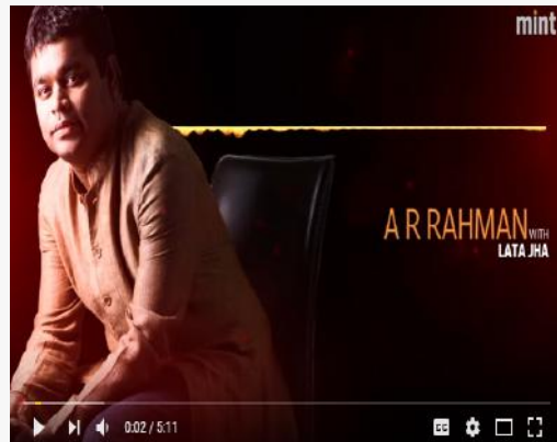
A.R. Rahman on 25 years of revolutionizing music