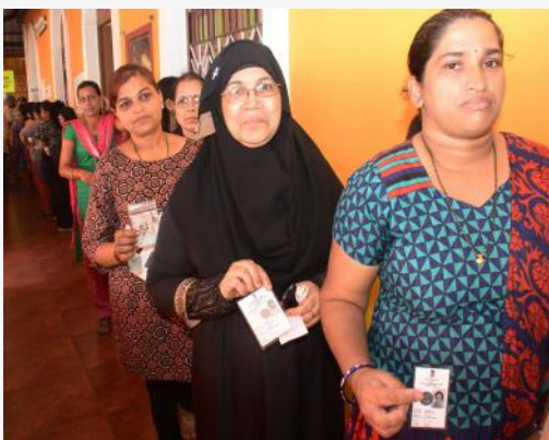
Women in a queue to cast their vote at a polling booth in Goa.