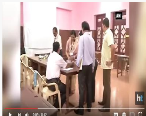
Goa Elections: Polling begins, Manohar Parrikar casts his vote